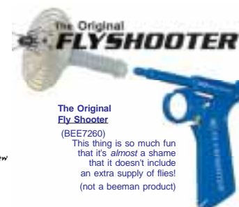
The Original Fly Shooter (BEE7260)

This thing is so much fun that it's almost a shame that it doesn't include an extra supply of flies! (not a beeman product)