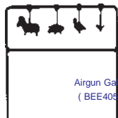
Airgun Gallery (BEE4050)